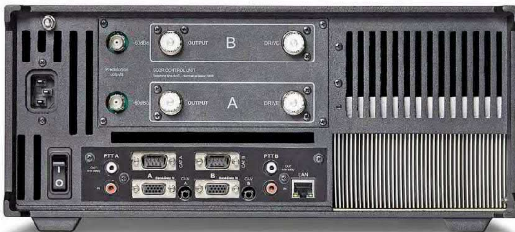
Figure 2 — The PGXL rear panel. RF input and output and predistortion sampler connections are in the upper center, with band data/CAT and PTT connections below.

ceivers, connect the PTT control to the appropriate PTT phono connector. Connect the transceiver CAT cable to the appropriate amplifier DB-9 CAT connector (optional if you plan to use RF sensing). That's it.